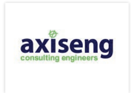
Mechanical & Electrical Consultant